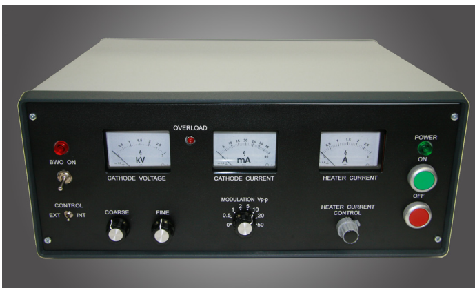
VR3 power supply for powering QS2 systems