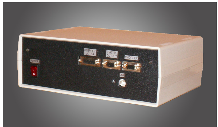
Data Acquisition Unit (DAU) for controlling BWO spectrometer systems.